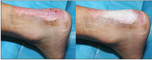
Figure 3: Application of transforming methacrylate dressing (TMD) over the right heel burns. A uniform layer of powder (TMD) is applied to the wound (Right). The wound is subsequently hydrated with sterile solution or exudate to allow it to transform into the conforming dressing. The second layer of powder is applied on top in the same fashion if required. Secondary dressing such as non-adherent foam dressing or simple gauze dressing is applied after TMD has adhered