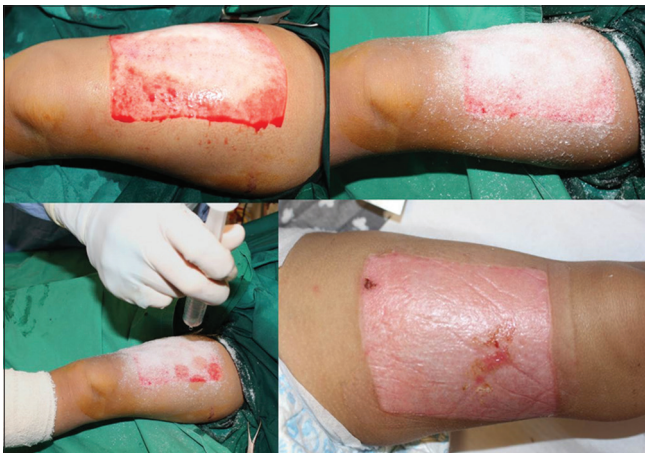
Figure 4: Management of the left thigh split-thickness skin graft (STSG) donor site with transforming methacrylate dressing (TMD). Top left: Split-thickness skin graft donor site, just after harvest with an electrical dermatome at 8/1000 th inch thickness. Top right: Application of TMD as previously described. Bottom left: Hydration of TMD with 0.5% bupivacaine in saline solution, instead of normal saline. This allows for added analgesia to the donor site. Bottom right: Appearance of epithelized skin graft donor site after 2 weeks

exudate, saline, or other sterile solutions. In addition, it has capillary channels which maintain the optimum environment for moist wound healing. [3-5] This dressing also seals the wound edges and is impermeable to bacteria, thus it serves to reduce the risk of further bacterial contamination. [4]