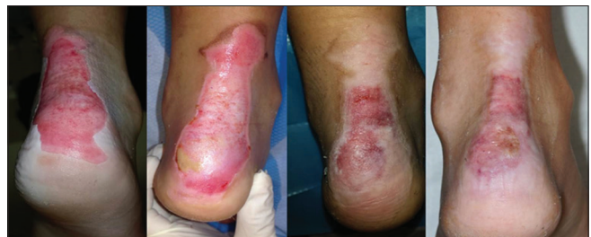
Figure 2: Management of the right heel burns with transforming methacrylate dressing (TMD). From leftmost: A 10-year-old boy with the right heel burns from oil scalding injury at presentation. Second from left: Further conversion of the right heel burns with a 2 by 5 cm area of deep dermal burns surrounded by partial-thickness burns sited the Achilles tendon. Second from right: Appearance of the right heel burns after 2 weeks of TMD. Areas of partial-thickness burns have epithelized well, with central deep dermal component still healing. Rightmost: Appearance of the right heel burns that had fully epithelized. There is a small scab which corresponds to an accidental scratch by the patient 1 day before the time of the photograph